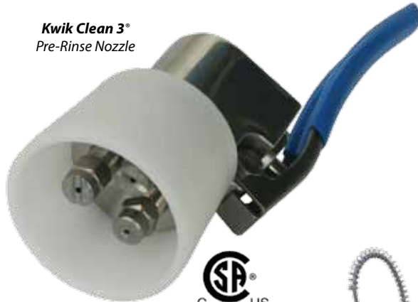
Kwik Clean 3® Pre-Rinse Nozzle