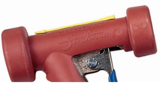
RUBBER COVER - RED