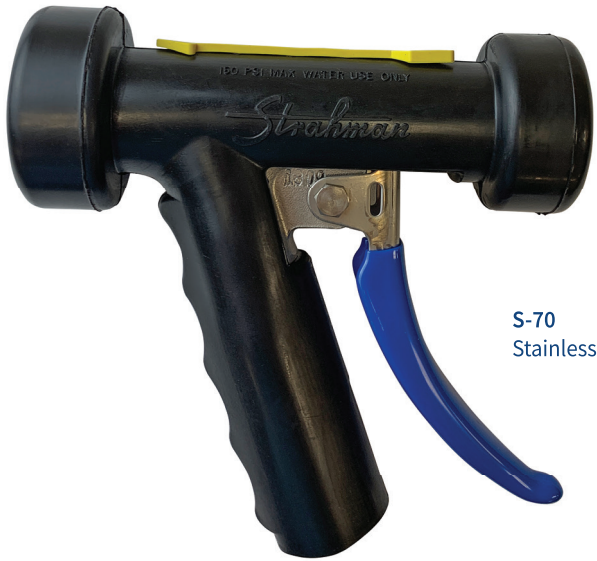
S-70 Stainless Steel