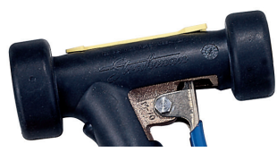
RUBBER COVER - BLACK