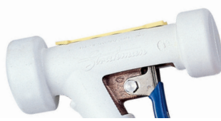
RUBBER COVER - WHITE