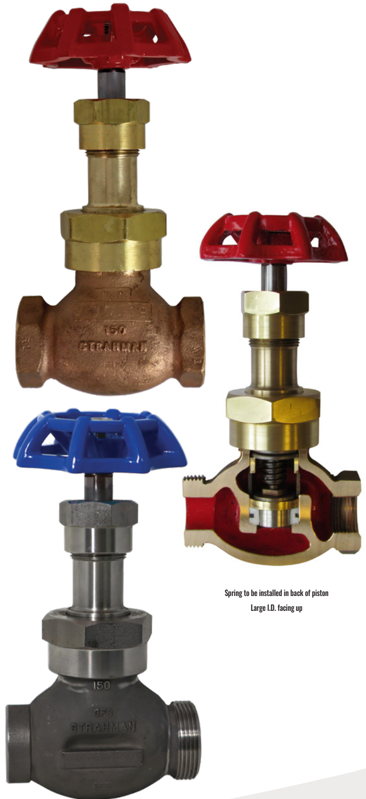
Spring to be installed in back of piston Large I.D. facing up

Base ring no longer necessary (older valves only).