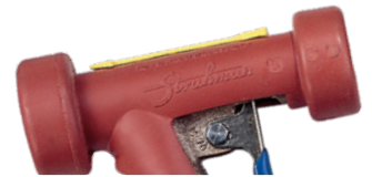
RUBBER COVER - RED