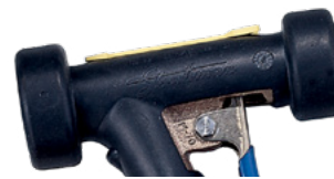
RUBBER COVER - BLACK