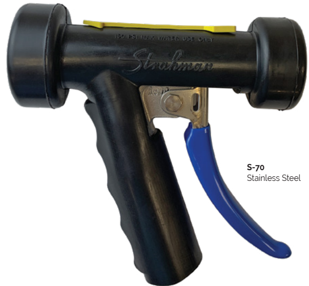
S-70 Stainless Steel