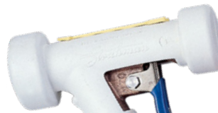
RUBBER COVER - WHITE